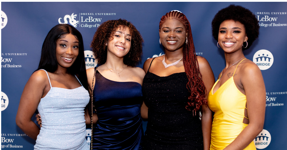
Students, alumni, faculty and staff celebrate at the BRIDGE 10th Anniversary Gala.