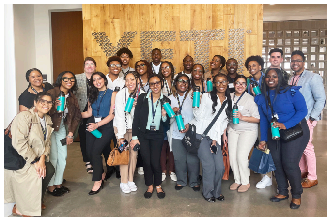
Students make connections during visit to YETI offices.