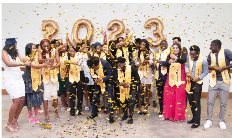
The BRIDGE Class of 2023 celebrates at the end of the academic year.

With the assistance of BRIDGE Partners and our BRIDGE Advisory Board, we are currently working on creating and implementing a wellness pillar for the LeBow BRIDGE Program. The main objective is to introduce our BRIDGE scholars to the importance of all the dimensions of wellness: Physical, social, occupational, spiritual, emotional, environmental, intellectual and financial wellness. We will be introducing a new wellness pillar for the upcoming academic years.